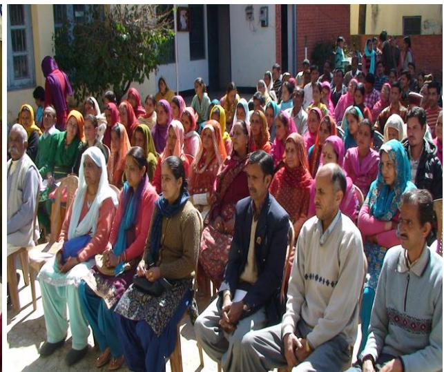
Photographs of Biodiversity Awareness Workshop at Kunihar, District Solan