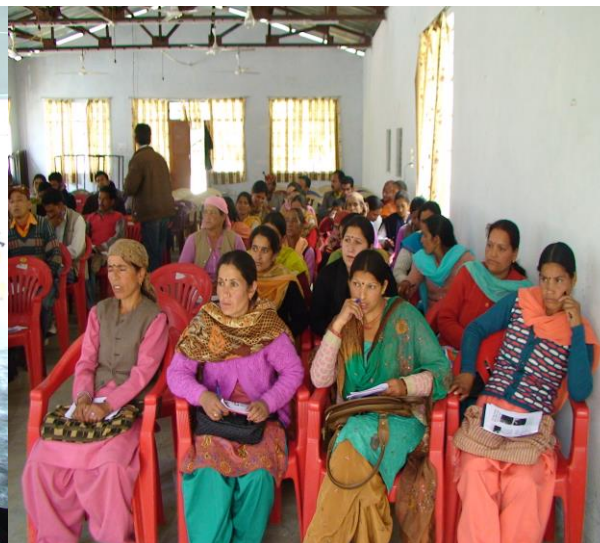
Photographs of Biodiversity Awareness Workshop at Banjar, District Kullu