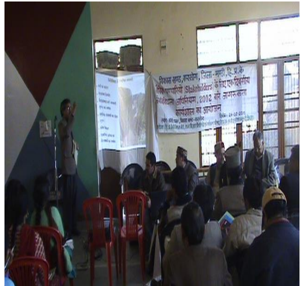
Photographs of Biodiversity Awareness Workshop at Karsog, District Mandi