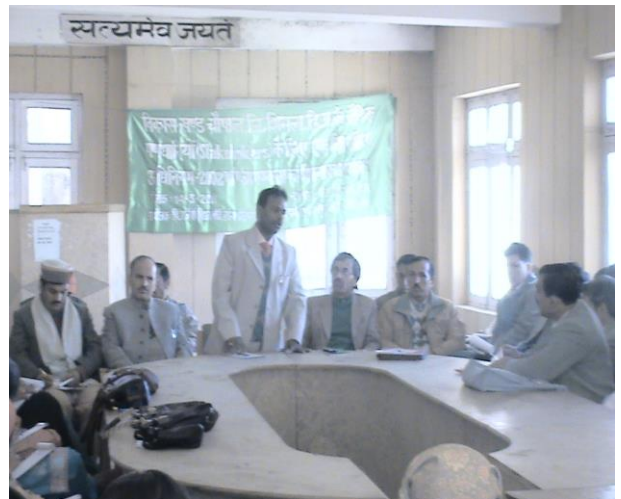
Photographs of Biodiversity Awareness Workshop at Chopal, District Shimla