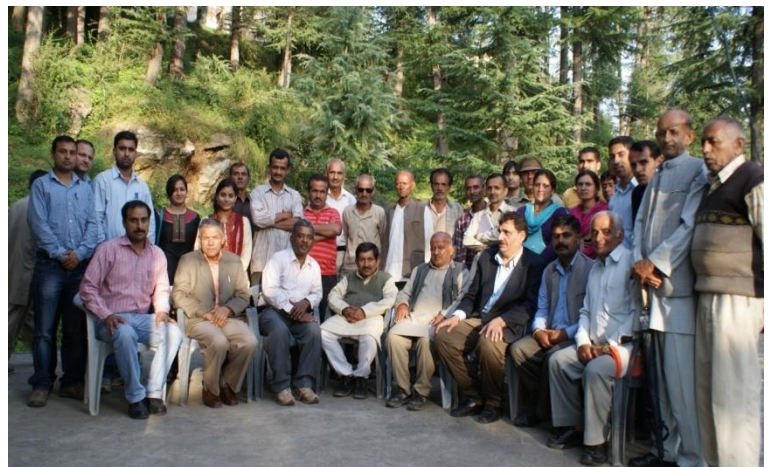
Orientation programme for preparation of model PBR at BMC Khatnol, Shimla